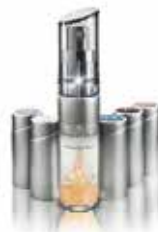
ARTISTRY Signature Select® Serum Amplifiers : H, B, S, F, W (Base: 121555 / H: 121556 / B: 121557 / S: 121560 / F: 121559 / W: 121558)