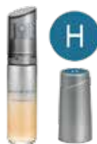
ARTISTRY Signature Select® Serum w/ Hydration (H) Amplifier (121555 / 121556)