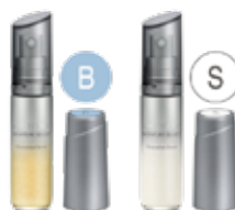
ARTISTRY Signature Select® Serum w/ Brightening (B) Amplifier (121555/ 121557) and Anti-Spot (S) Amplifier (121555 / 121560)