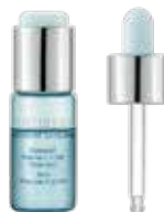
INTENSIVE SKINCARE Advanced Vitamin C + HA Treatment (120524)

The DERMA ION GALVANIC will only operate when you grip the Electrode metal part of the ARTISTRY SKINCARE ENHANCER, and the metal head touches the skin.